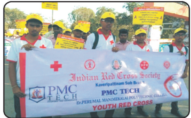
Our YRC, NSS Students attended Cancer Awareness Rally on 4th Feb 2020 in association with Lions Club of Hosur Sipcot