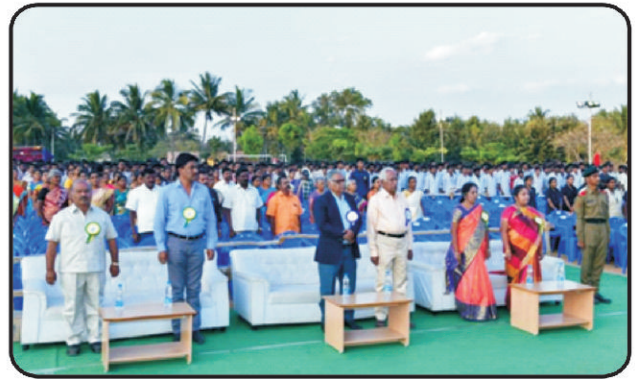
Our EEE Students Participated in Cultural program in our College Annual Day 2020