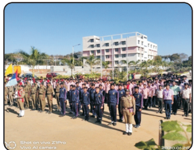
Our EEE Students participated in 71st Republic Day celebration on 26/1/2020