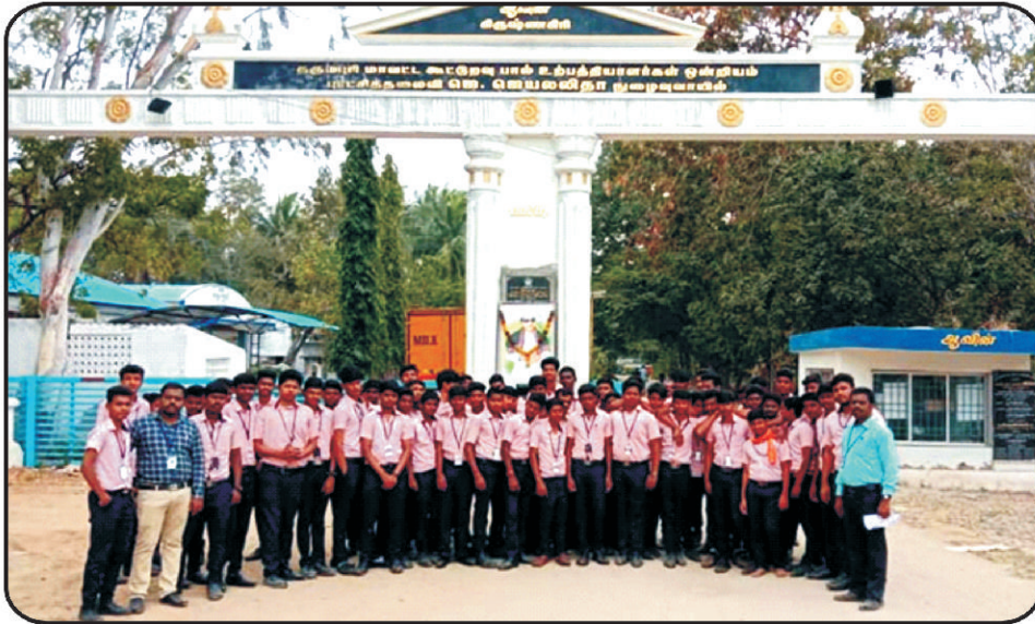
Second yr EEE visited Aavin Milk Production Depot, Krishnagiri on 23/2/2020

In order to provide real time environmental exposure to our students, they have been taken to Industrial visit. As an impact the students were made aware of the latest trends in the interdisciplinary areas of EEE.