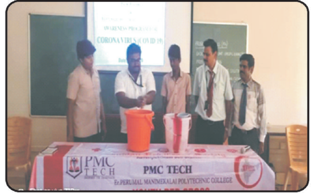
Our EEE YRC, NCC, NSS Students get awareness on Covid-19 Virus from Shoolagiri Health Block