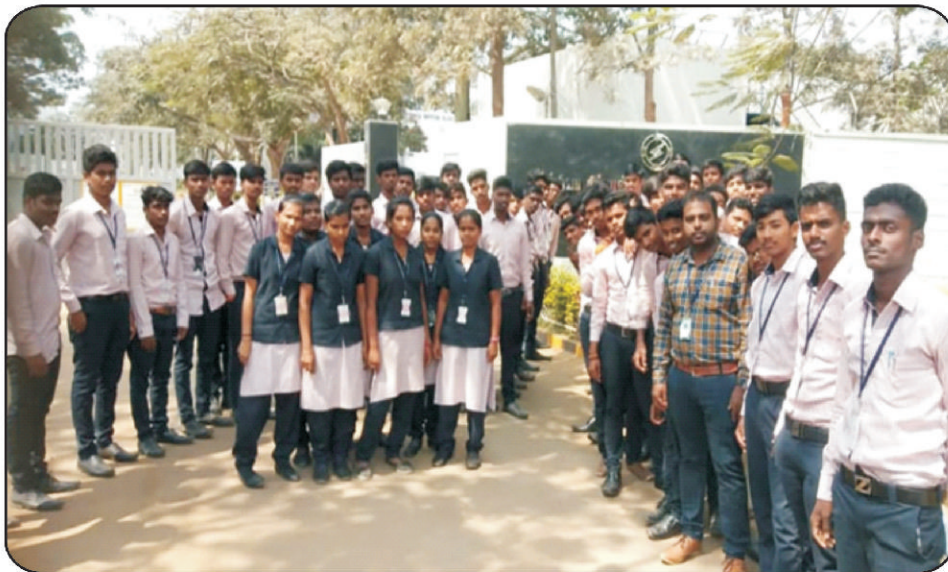
Third Yr EEE Visited Indian Nippon Electrical Limited, Hosur on 7/2/2020