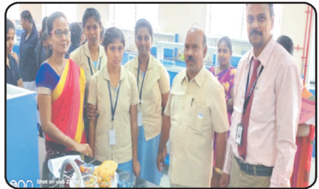
Our Third Yr EEE Girls Participated Cooking Competition on 08th March Women's Day 2020