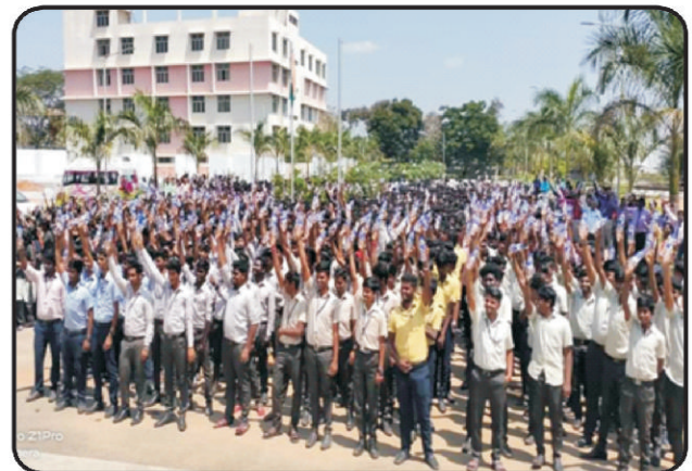
Our Polytechnic YRC, NSS Unit organize World Kidney Day on 12th march 2020 in Association with Kauvery Hospital, Hosur.