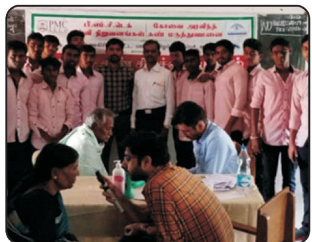
Our EEE Dept Staff and Students organized Eye Camp at Thally, Hosur Block.