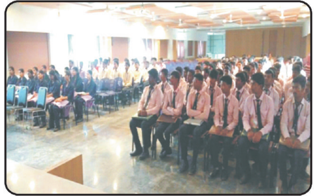
Our EEE Students in Campus Interview