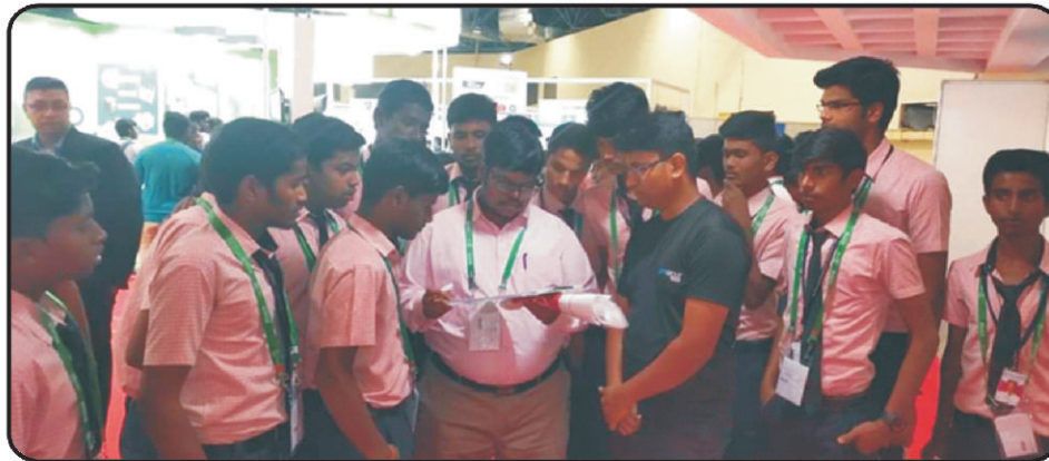
Second yr EEE Visited IOT Show, KTPO Trade Centre, Bangaluru on 15/2/2020