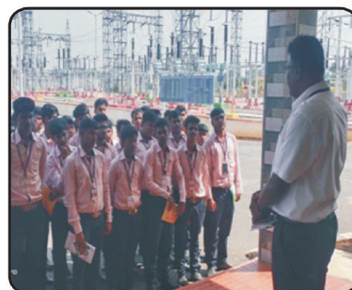
Third Yr EEE Visited Gurubarapally 230KV SS on 24/2/2020