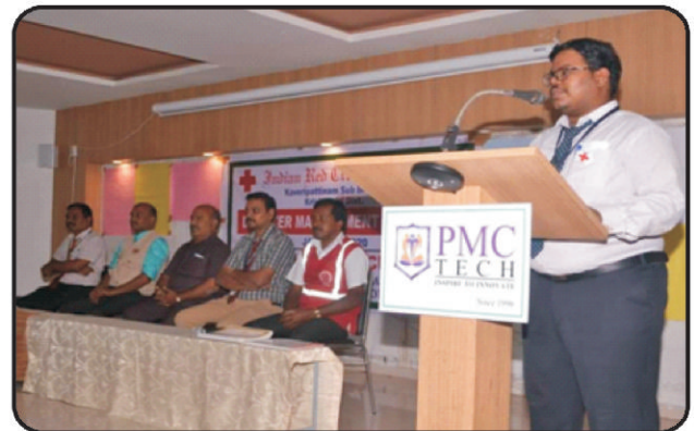
Our YRC Students Participated Training in Disaster management from IRCS Kaveripattinam Sub Branch on 25th Jan 2020