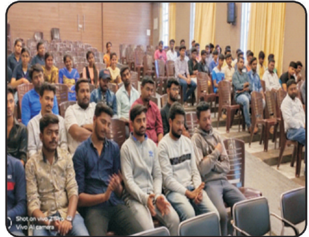
Our EEE Students attended Alumni Meet 2020