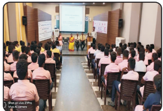
Our EEE Students get awareness on Covid-19 Corona Virus organized by YRC, NCC Units on 12th March 2020